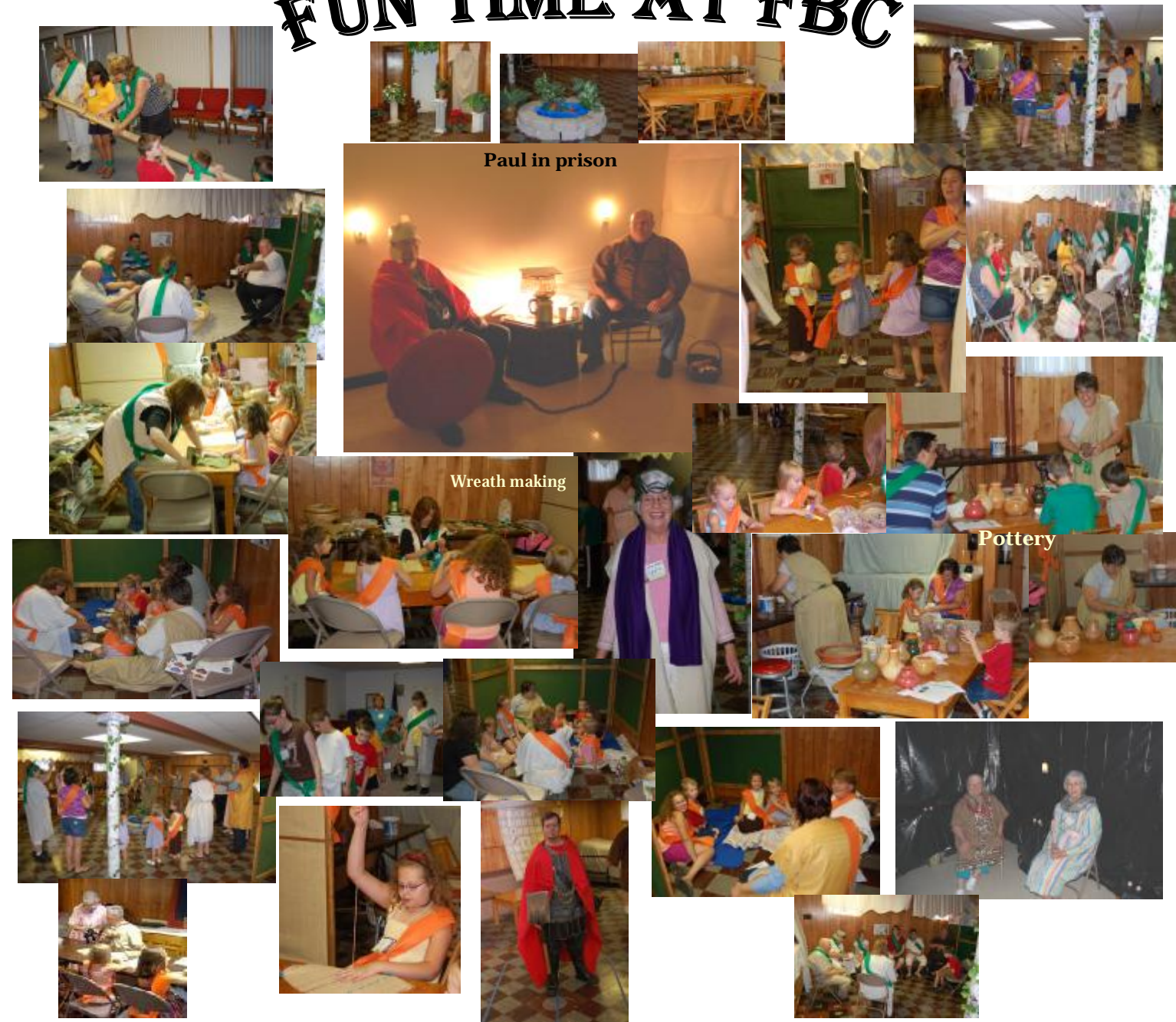
Paul in prison